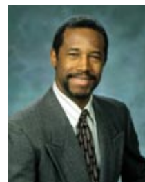
Dr. Ben Carson

Food and Fitness Channel — Contains exciting, yet healthy recipes by Patti LaBelle and the also legendary singer, Gladys Knight, among others. There's also a Food Trivia Quiz, "Walking for Health and Fitness" tips, and much more. See Page 4 for a sample list from the Recipe Directory.